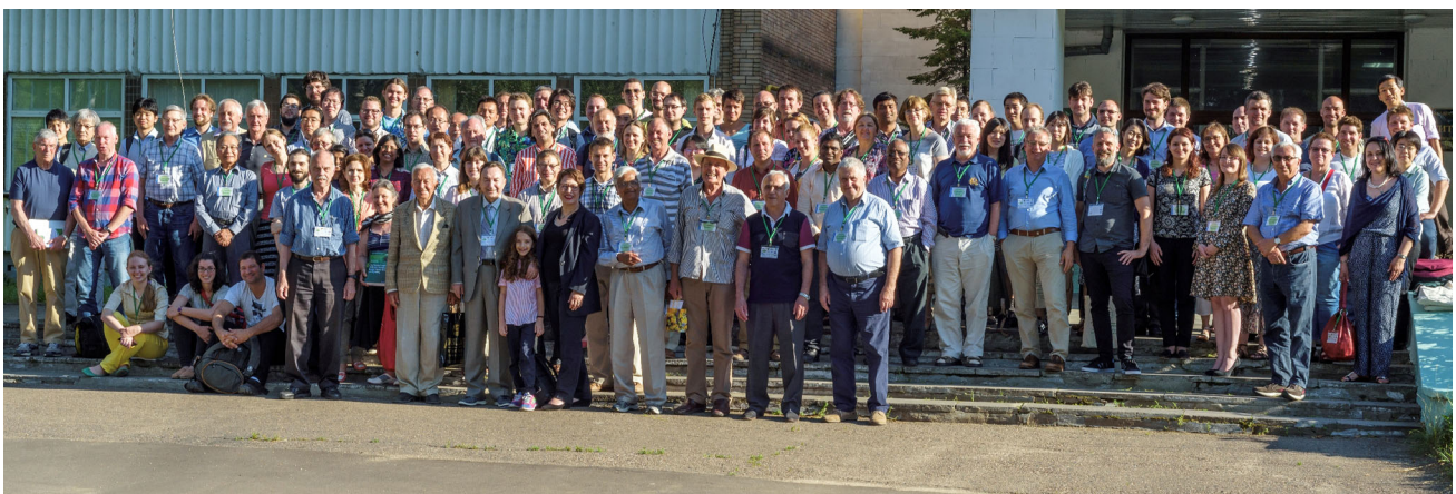
Fig. 1 A group photograph of the participants and the organizers of the 7th International Conference “Photosynthesis Research for Sustainability-2016: in honor of Nathan Nelson and T. Nejat Veziroğlu”