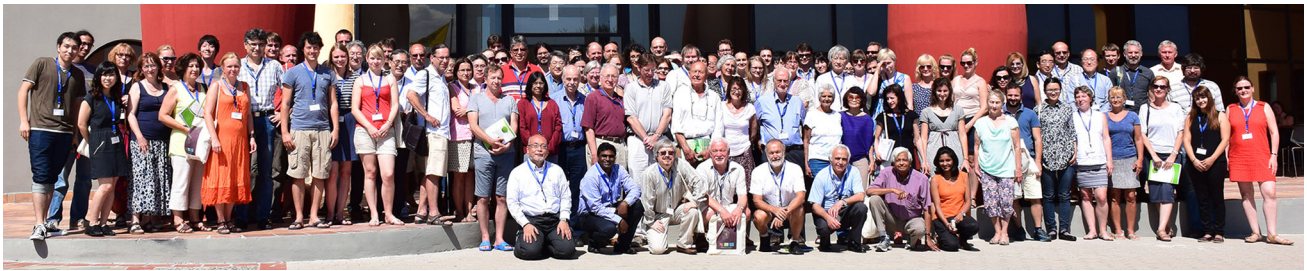
Fig. 1 A group photograph of the participants in front of the conference building.

countries. Figure 1 shows a group photograph of the participants at this conference that was held during September 21–26, 2015 in Crete. It was a great occasion for discussions of molecular to global aspects of research on photosynthesis ( http://photosynthesis2015.cellreg.org/Programme.php ).