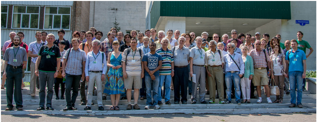
Fig. 1 A group photograph of some of the participants at the front of the conference building; Vladimir Shuvalov, the honored scientist, is standing 7th from the right in the front row